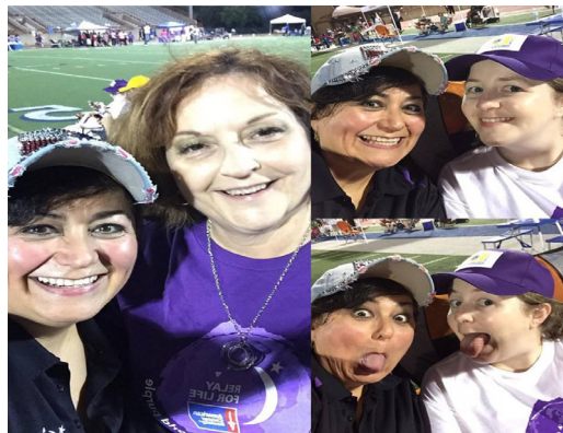
Evening Branch Club participating in Relay for Life