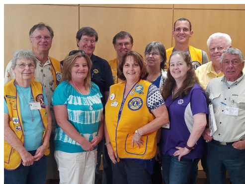
Lions 2X-1 University