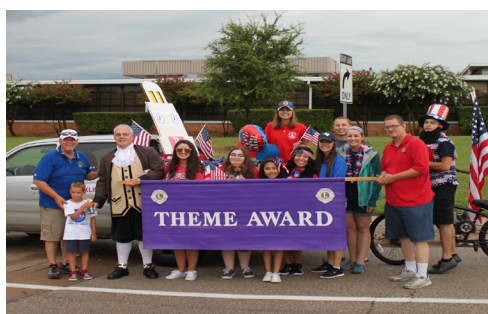
Theme – Ben Franklin Apothecary and Kitchens Deli