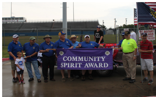
Community Spirit – Duncanville Rotary Club