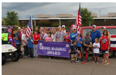
Grand Marshall – First Christian Church