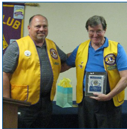
Duncanville Noon "Grass Roots Lion"