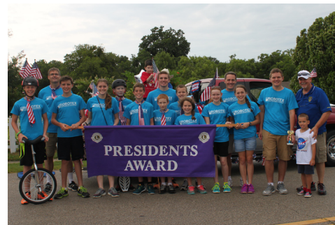
Presidents – Best Robotics Home School Alliance