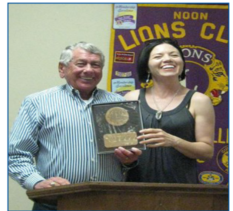
Cub Lion of the Year