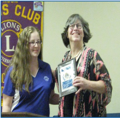
Duncanville Evening "Grass Roots Lion"