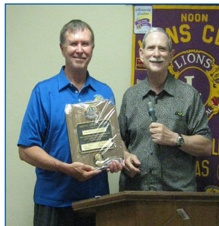
Melvin Jones Fellowship