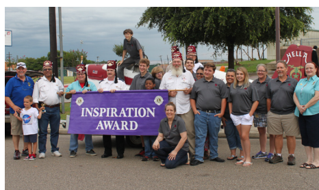
Inspiration – Hella Shriners