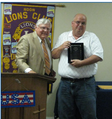
Jack Wiech Fellowship