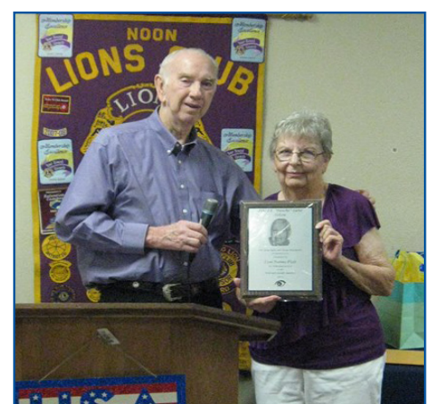
Pancho Luna Award